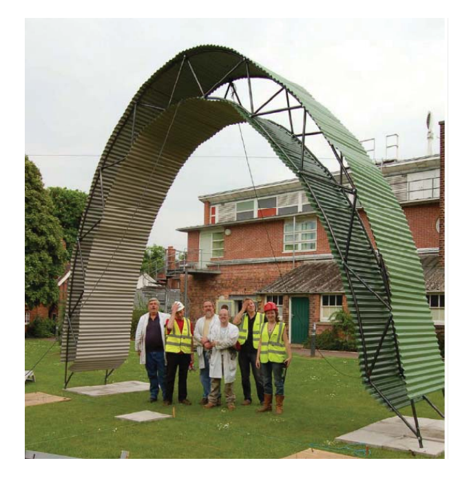
Figure 3. Completed prototype of structure.

went out for additional helpers to pull the arch into its vertical position, and a crowd of over 40 people materialized to observe the event. Immediately after the arch was lifted and secured in its vertical position, spontaneous celebrations erupted.