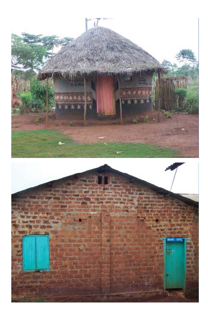
Figure 1. Typical hut built with adobe construction and. typical mud-brick construction

branches set vertically in the earth and woven together with smaller branches to form a simple flexible frame with voids filled with hand-mixed mud. Mud slurry is typically applied to the walls and rendered smooth before being painted or whitewashed and decorated with traditional patterns. The roof was supported by a central pole supporting radiating sticks which were covered with dried grass for shading. A typical adobe structure required approximately two months to complete [Figure 1]. These structures were subject to several common failures, including wall and roof erosion, roof leakage, susceptibility to structural damage to roofs from high wind, and fire damage from cooking or lighting with an open flame.