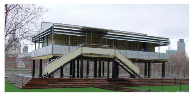
Figure 2. Anderson Shelter (above) and Tropical House by Jean Prouvé