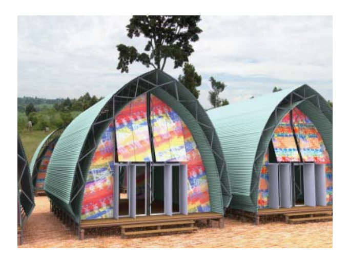
Figure 5. Proposal with local artwork.

Computer models were used to develop representations that would assist the community members in understanding the master plan [Figure 4]. Given the nontraditional form of the buildings, the computer models were used to familiarize the villagers with the structures. This approach relied heavily on photorealistic renderings using perspective matching with site photographs. The goal of this strategy was to enable the villagers to see the proposed structures located in the actual context of the site. Consistent with the community engagement priorities of the project, computer rendering enabled the project teams to develop representations that integrated the artwork developed in the workshops held during the initial site visit to Kyoma East Village as well as artwork from later drawing workshop with the children. [Figure 5]