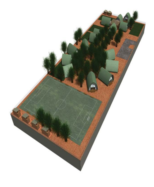
Figure 4. Master plan rendering.

Lastly, the building configurations to be used in the community master plan were finalized. Based on input from the village community, the master plans were developed to provide both school facilities and health service facilities on the same site.